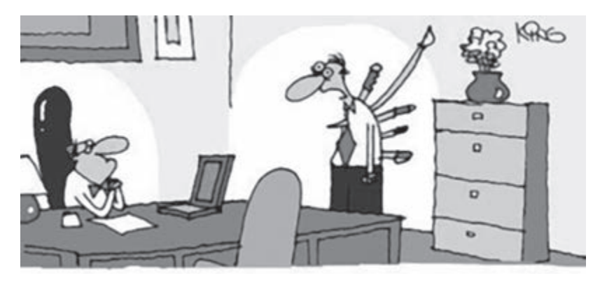
"I don't think the employees like me."