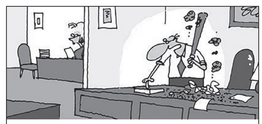
"Ms. Johnson, would you mind ordering me another computer? And you can cancel that call to tech-support."